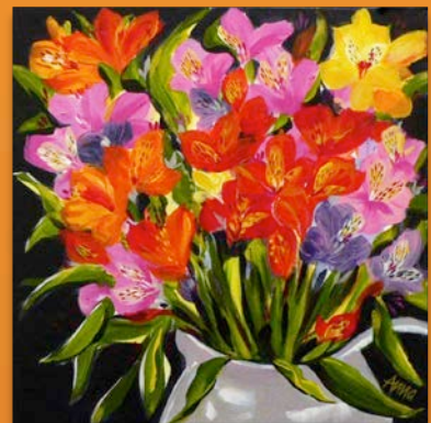
Images of works from 45 x 45 Members Exhibition , 2018