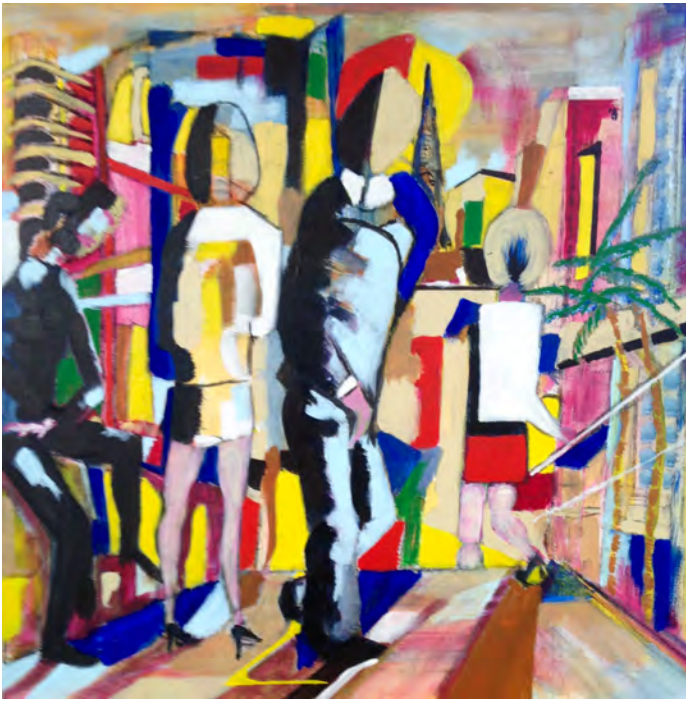
Peter Fitzpatrick People within the invisible city Acrylic on canvas