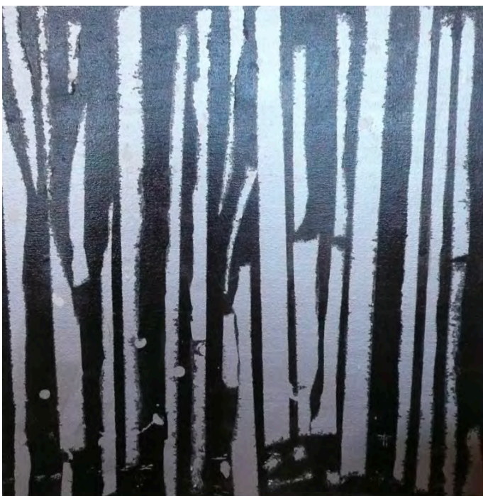
Ros Cranch Night in the woods (detail) Acrylic on Canvas

All works are for sale (prices listed). To purchase works featured in this edition, please refer to purchase procedures listed after the exhibition images.