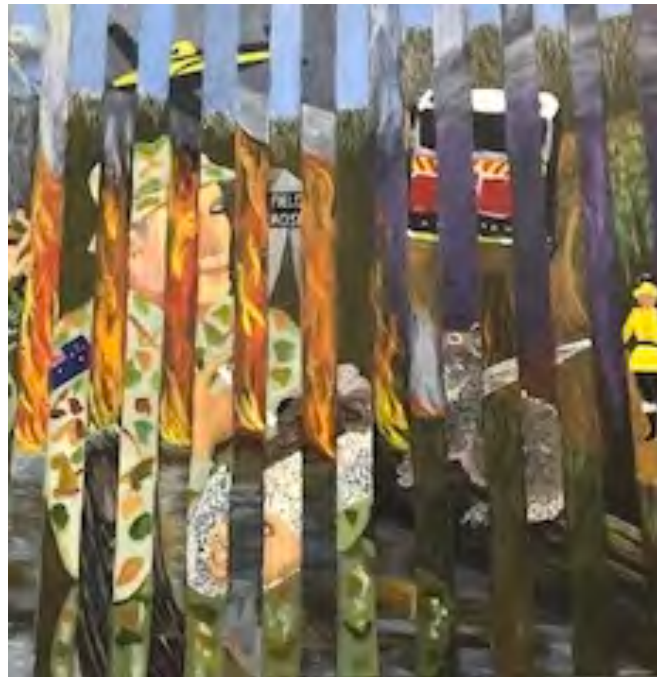
Sue Littler Hope wins (detail) Acrylic on canvas