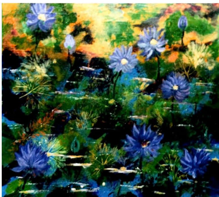
Maree Cameron Water lilies Mixed media on canvas $280