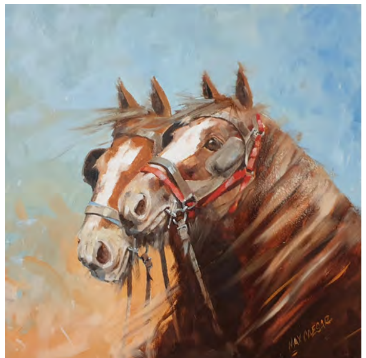
Max Caesar Workmates in the wind Oil on canvas