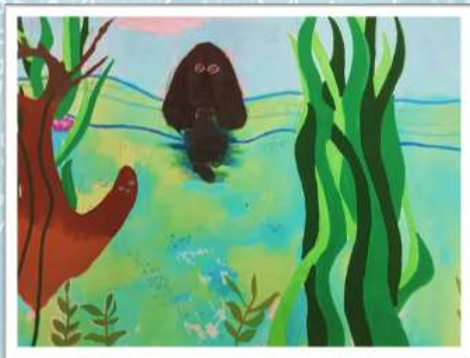
Abbie Hunt age 8