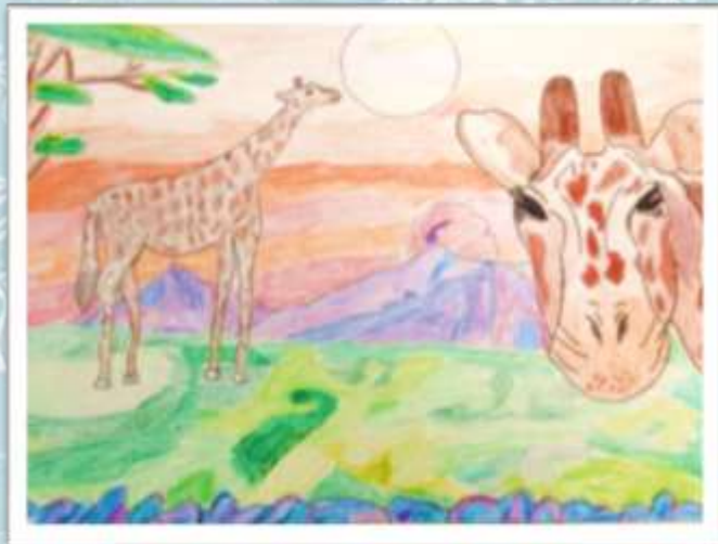
Joshua Stapleton age 13