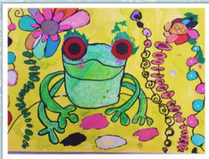
Gurnoor age 8