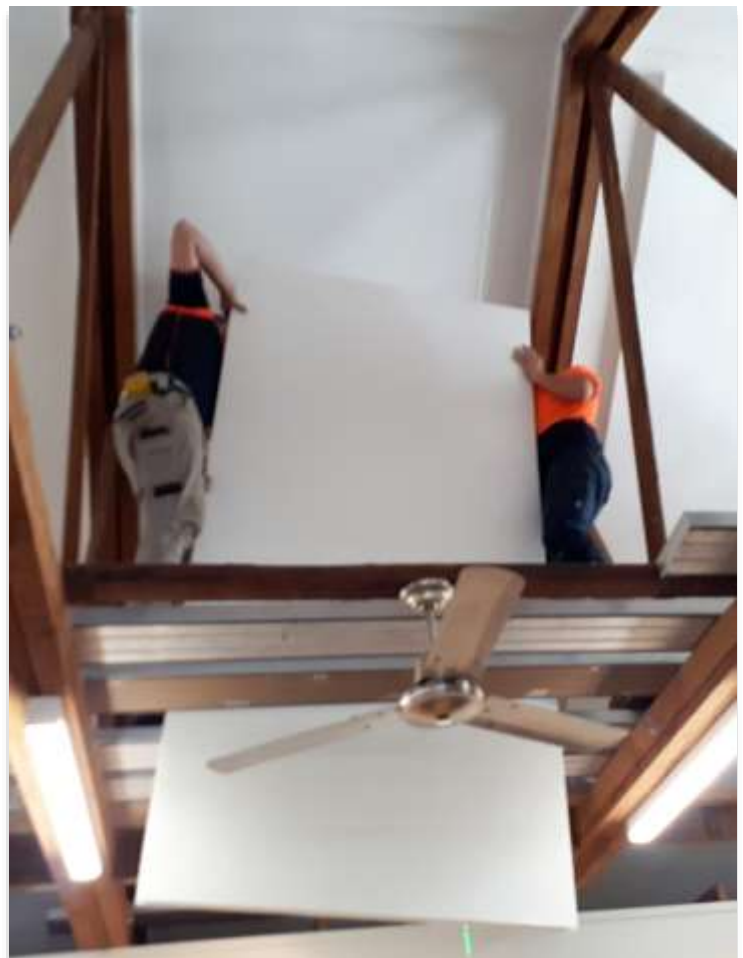
Taking the panel