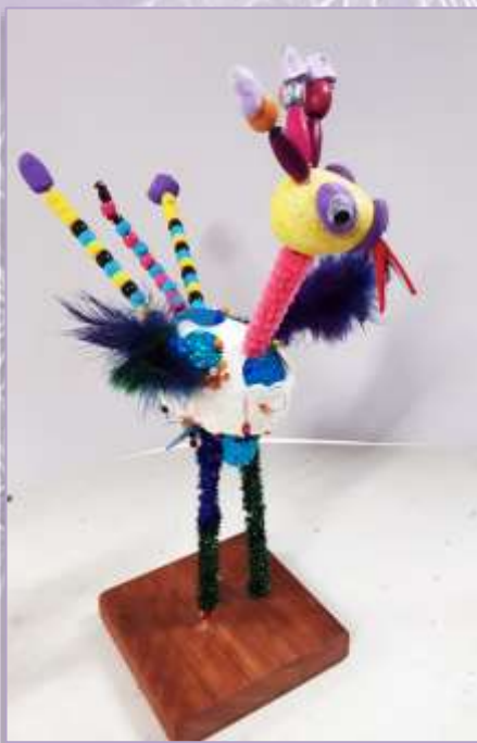
Mackenzie Tsao age 5