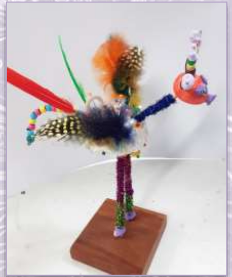
Shaun Tsao age 5