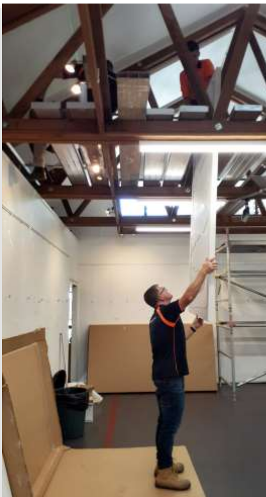
Passing up the next panel