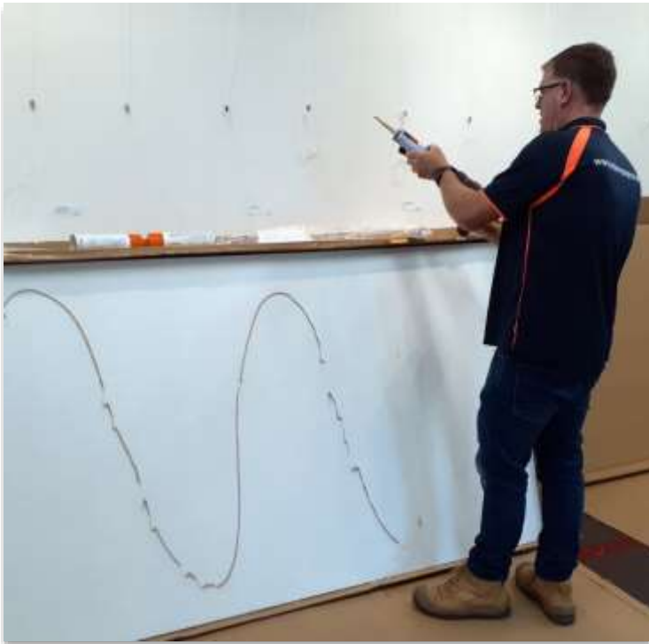
Applying the glue

Next on the agenda – installation of air conditioning in Studios 1 & 2 and the office on 18 th May!