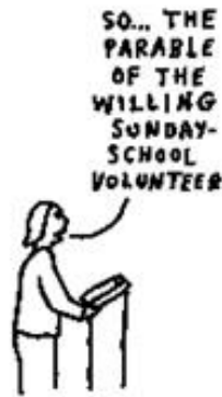
MAKING SUBTLE REFERENCES