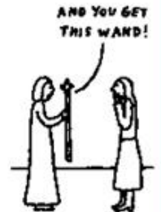
USING A STICK