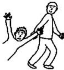
GETTING EXISTING VOLUNTEERS TO BRING FRIENDS